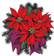
Thank You from the Staff

We all appreciate your generosity year-round, and especially at the holidays, both in your gift and in allowing us time off to be with family and friends to enjoy this special time. We hope your holidays were merry and bright!